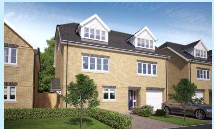
3 bedroom semi detached with west facing garden with either garage or extra reception room

Why not come down and see where you could be making your next move.