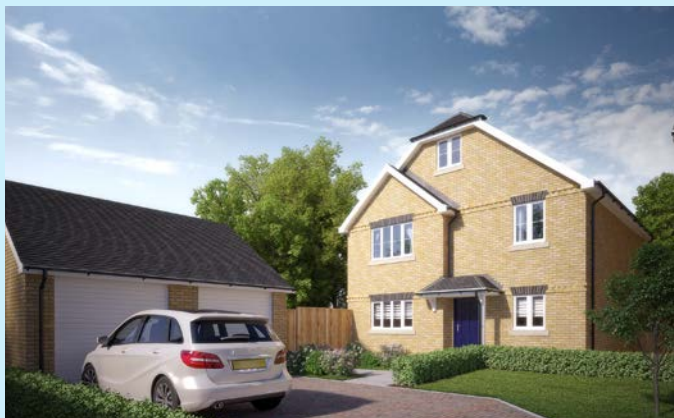
4 bedroom detached with bonus loft room & double garage

This will be Phase II for this popular site located at the end of Ruskin which is off the Henley road.