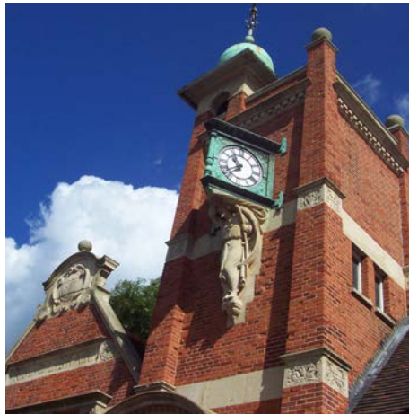
Old Father Time at Caversham Library

Caversham Library provides a range of highly valued inclusive services and is a hub at the heart of the local community. In addition to the usual library services, it is a central point